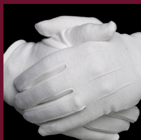
CELEBRATING OUR YOUTH AND INTERMEDIATE USHERS Page 3