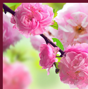
MOTHER'S DAY TRIBUTES Page 9