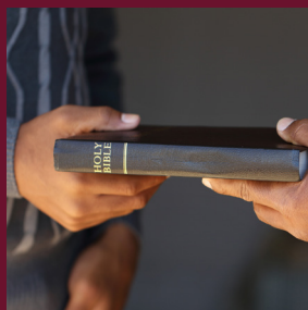
CONGREGATIONAL CARE LAY MINISTRY Page 6 & 7