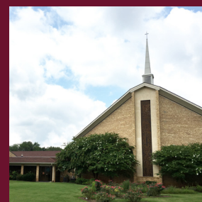
A SALUTE TO OUR NONAGENARIANS Page 10