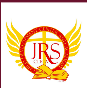
WHAT'S HAPPENING AT THE JRSCDCA Page 4